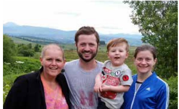
International Mission Board Scotland Team

The International Mission Board (IMB) of the Southern Baptist Convention desires to partner with Scottish churches in ways which bless the church and help them engage in areas of communities which currently have a less-than-vibrant expression of faith. The church chooses what they desire in regards to what type of volunteer and length of time. A volunteer would come to serve your church for 12 to 24-months in the capacity that best fits your needs. This may be in youth & children's ministry, engaging with adults or all of the above as you reach out into a community. It could be with helping to set up a project within the church or a community project connected to the life of the church. IMB will recruit to suit your request, as well as ensure all recruits have participated in child protection training, received police